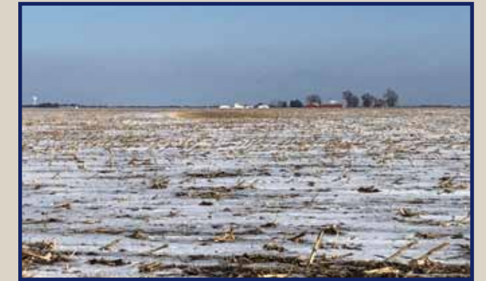
AERIAL & SOIL MAPS ON REVERSE SIDE